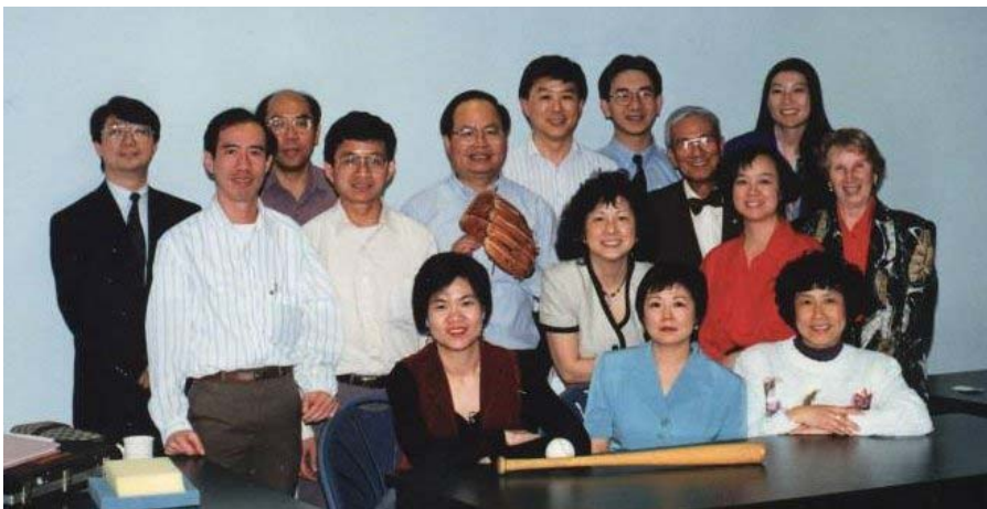
After a meeting in 1995

"Many of the members formed close friendships within the club and became like extended family to one another."